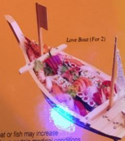
Love Boat (For 2)

** Consuming raw or undercooked meat or fish may increase Your risk of food borne illness, especially if you have certain medical conditions Before placing your order, Please inform your server if a person in your party have food allergy