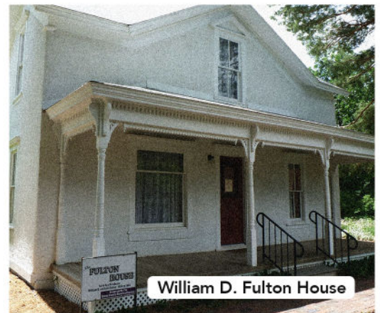
William D. Fulton House