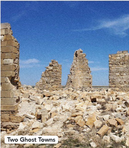
Two Ghost Towns