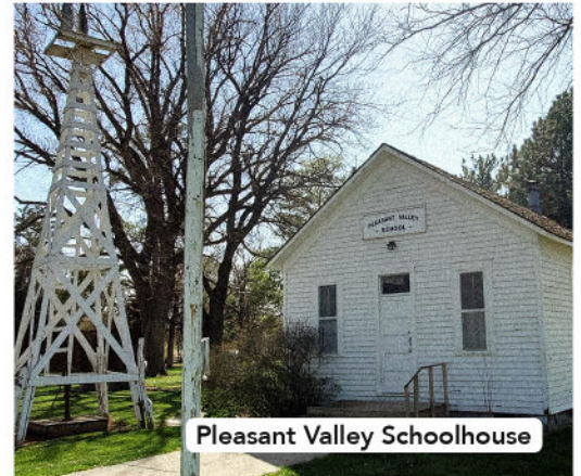
Pleasant Valley Schoolhouse

Located west of the Museum, one-room schools like this were typical in early-day Finney County. Open by appointment. Call (620) 272-3664.